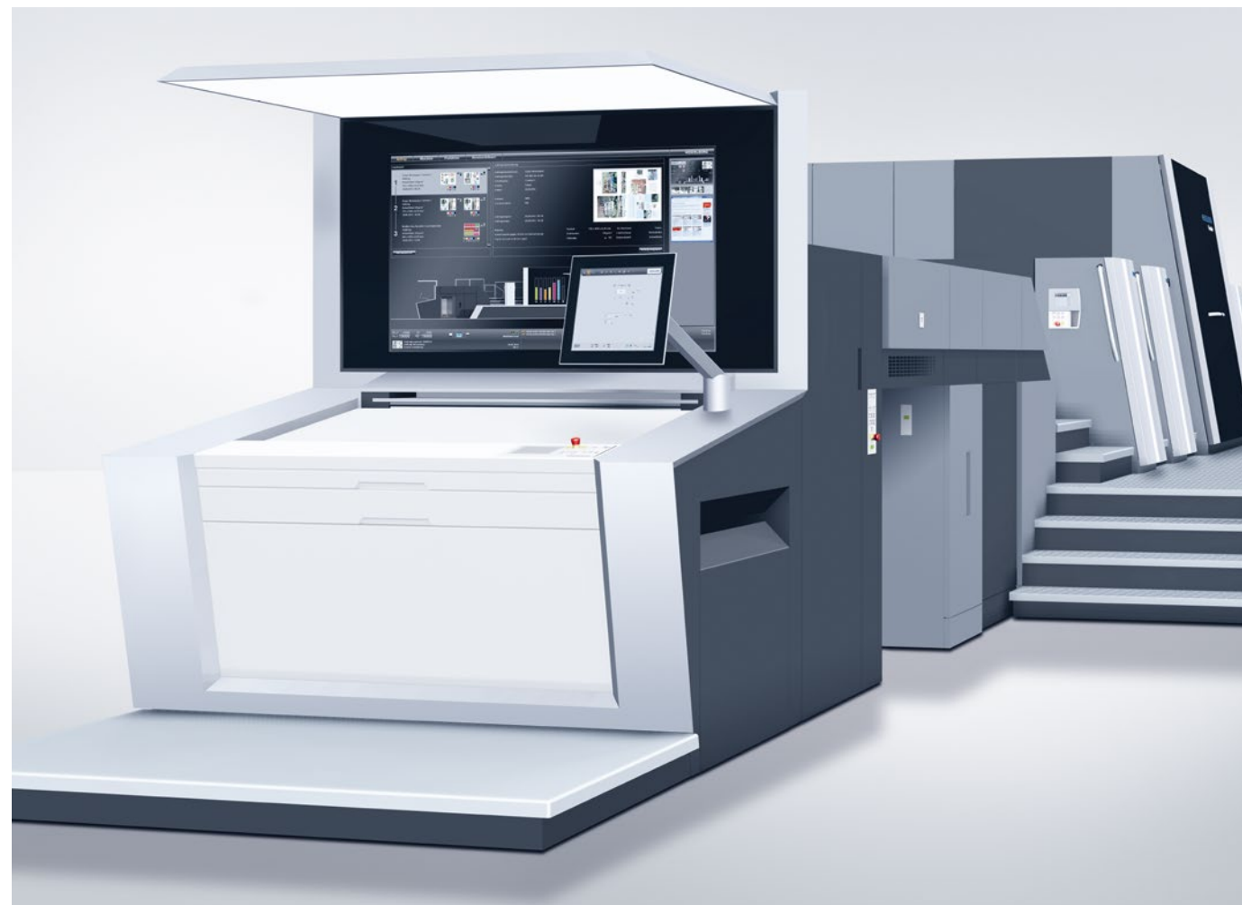
Princt Digital Center Inline with proven Heidelberg operating concept and Perfect Stack Technology for fast and reliable processes.

Powerful technology partnerships, workflow integration and state of the art process engineering for the interplay of printhead, ink and substrate. For your creativity in an industrial environment.