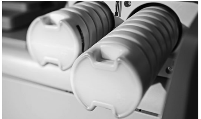
Double toner cartridge bay for uninterrupted production.