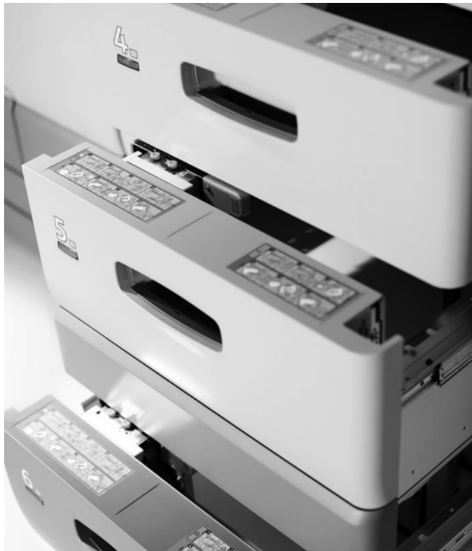
Large capacity trays with up to 8,850 sheets.