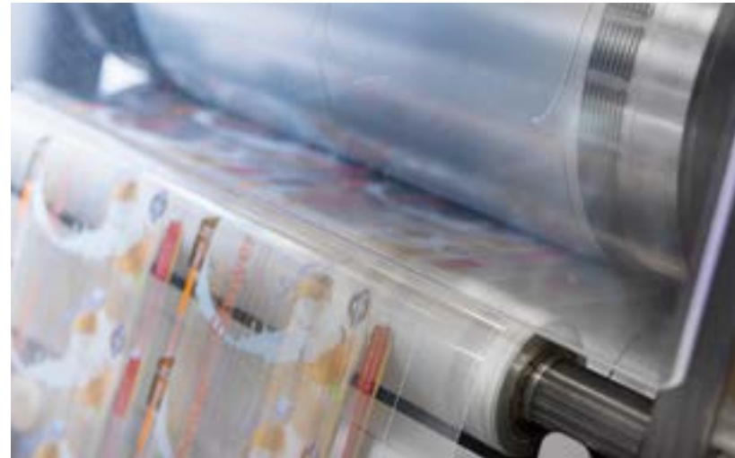
Semi-rotary die-cutter for minimised tool costs and a wide choice of substrates.