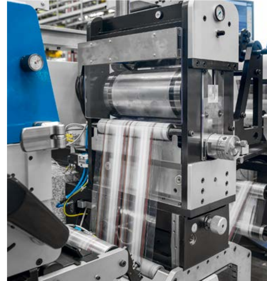
Semi-rotary die-cutter with compensator.

The digital front end of the Gallus Labelfire 340 delivers a number of impressive practical functions including spot colour matching, the PDF Toolbox and Prepress Manager, to name but a few. All conventional print functions available meet the requirements for efficient production of short runs through optimised setup times, minimal waste and tool costs. In addition, the double rewinders enable rapid changeovers and crossed winding of small narrow rolls and also support minimal setup times.