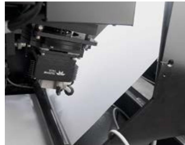
Inspection system for ensuring quality is consistent.