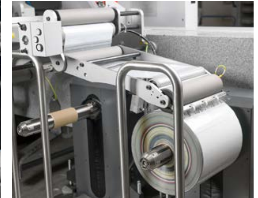
The double rewriter enables interlaced winding of small reels and setup during production.