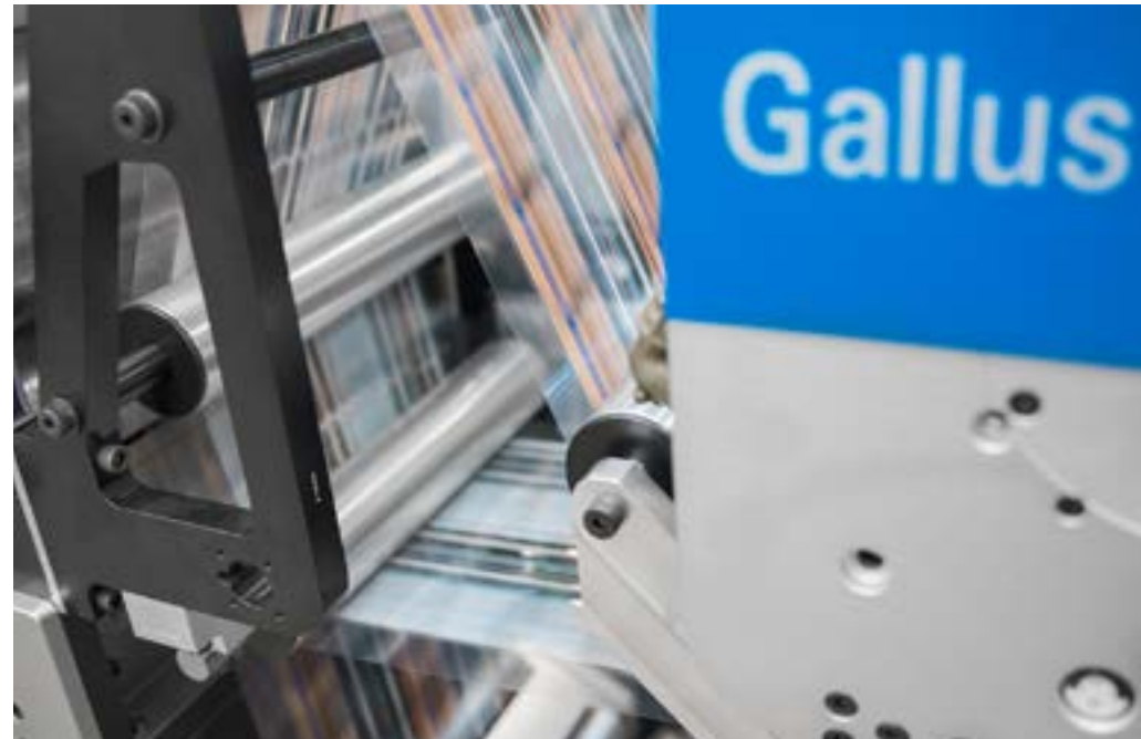
The Gallus Labelfire 340 combines the speed of flexographic printing with the efficiency of digital printing.

The Gallus Labelfire 340 conventional printing functions also deliver additional finishing options and inline further processing, e.g. varnishing, laminating and die-cutting. The semi-rotary die-cutting unit also delivers further benefits – printers can re-use existing die-cutting plates, meaning fewer new ones are required and thereby reducing procurement costs for these. The fair, consumption-dependent business model ensures that ink prices and service provision reflect the market and that customers benefit directly from the process optimisation achieved.