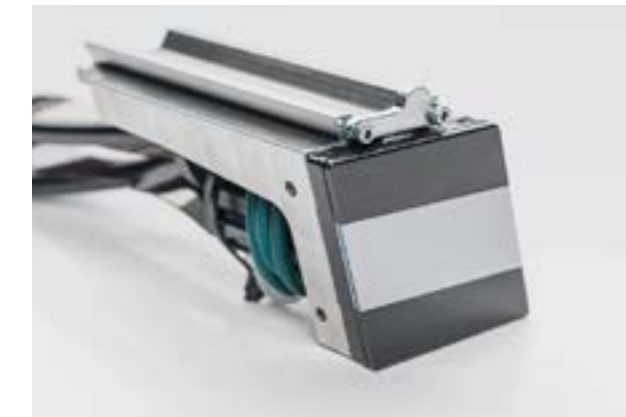
The unique rhombic shape of the heads makes it easier to achieve a seamless fit between the heads to create a smooth colour progression.