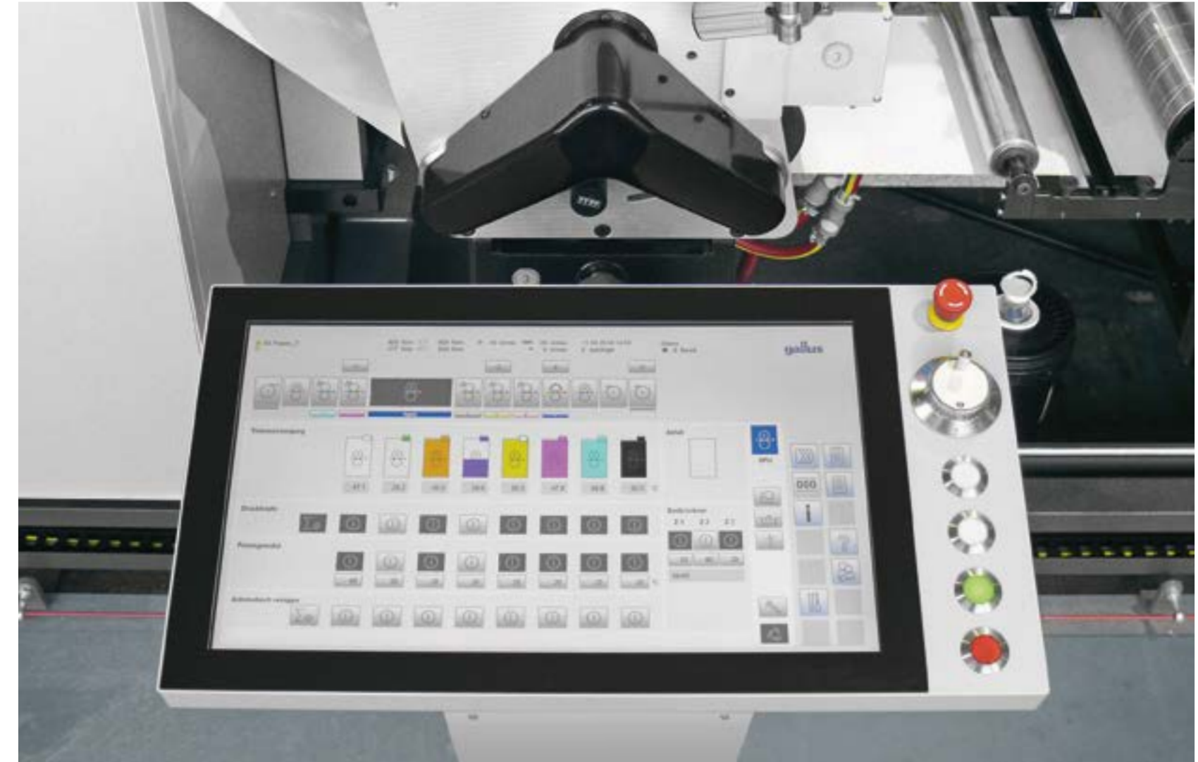
The “cockpit” shows the user all the important parameters at a glance.