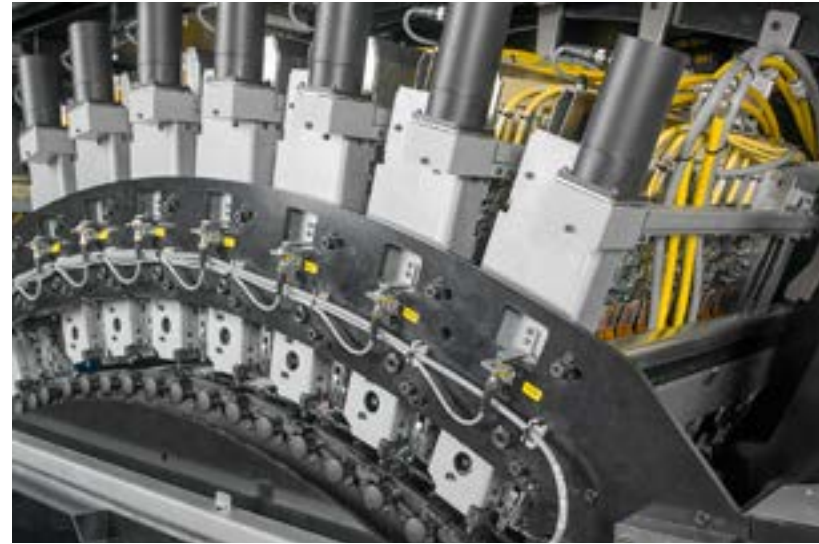
Eight-colour printing system for a bigger colour gamut.

With the Gallus Labelfire 340, the engineers at Gallus and Heidelberg have succeeded in developing a highly innovative digital converting system. The compact digital production system combines unrivalled UV inkjet printing quality and maximum-efficiency digital printing with the inline productivity and speed of flexographic printing. It goes without saying that this industrial inkjet press system also meets Gallus's high standards in terms of register accuracy.