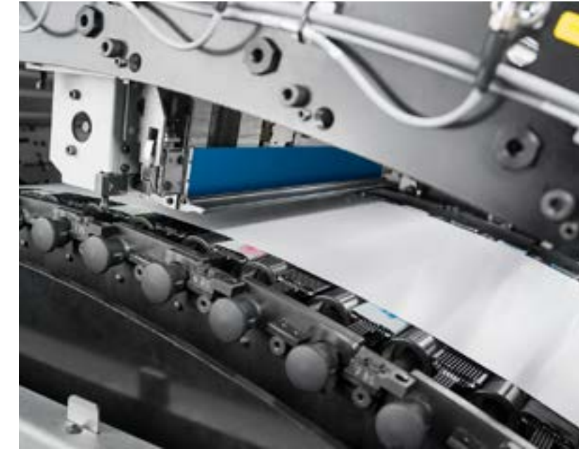
Inter Color Pinning ensures excellent printing quality and a wide choice of substrates.

The unique shaped inkjet print head enables seamless inkjet head stitching, resulting in a smooth print across the entire web. The combination of digital white, CMYK, the colour space enlargement colours orange, violet and green, as well as 7-colour separation mean the Gallus Labelfire 340 press system can cover a large portion of the Pantone colour space. All of this is made possible by the use of specially developed screen and colour management algorithms that Heidelberg has been utilising with great success in its offset prepress solutions for decades.