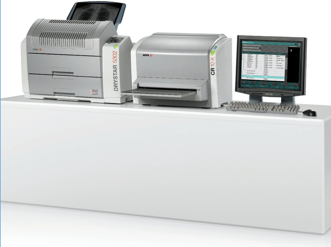
CR 12-X from Agfa - Fast - affordable - high quality imaging

The CR 12-X, NX Workstation and SE software suite deliver a seamlessly integrated solution. CR 12-X and DRYSTAR 5302 - the perfect combination.