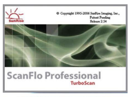
ScanFlo software is provided with SunRise 3-in1 scanners

Scanflo Professional is used world wide, by professional microfilm service bureaus, government agencies, librarians, and digital archivists, and to that audience Sunrise Imaging Inc. is dedicated to delivering exceptional quality microfilm scanners.